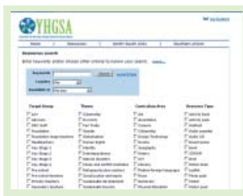
A page from the YHGSA resource website